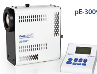
pE-300 white : Simple controllable fluorescence