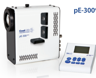
pE-300 ultra : Fast, controllable illumination

Since our team of four introduced the first commercially available LED illumination system in 2006, we have led the way in transforming light source technology for fluorescence microscopy. Now we are a fast-growing company in Hampshire with a vast product range and technical expertise spanning optical engineering and the life sciences.