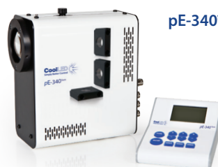
pE-340 fura : Fast, controllable illumination for Fura-2