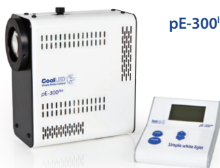
pE-300 lite : Simple white light