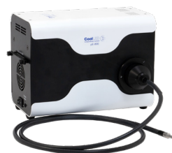
pE-800: 8-channel illumination and lightning fast control